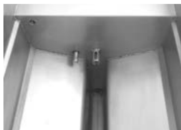
Low Oil Volume Frypot - LOV Gas