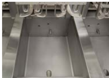
Low Oil Volume Frypot - LOV Electric