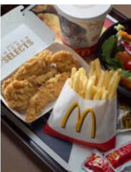
Improved Food Quality