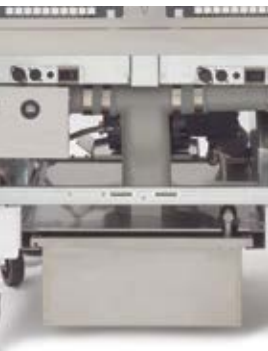
Automatic Intermittent Filtration